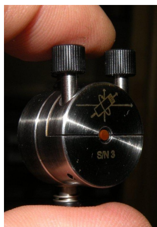
Rear View (2.5mm in this example)

The most difficult part of this procedure is to move the end cap or base plug if applicable relative to the rotor, even if only a few tenths of a mm. Once this is achieved, two things occur: The gap is now bigger between the rotor and the cap, and as the molecular bond between the cap shaft and the inner wall of the rotor is temporarily disturbed, the cap shaft can move easier.